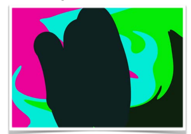
Student artwork created by 10-year-old Semaria

Recognizing community offerings for children in the arts and technology were sorely missing, the program selected to incorporate music, art and STEM in conjunction with YOGA, meditation and mindfulness. Collectively, these offerings provide the platform needed to increase competency in Social-Emotional-Behavioral wellbeing, along with channels of expression that lead to increased positive self -thoughts and understanding.